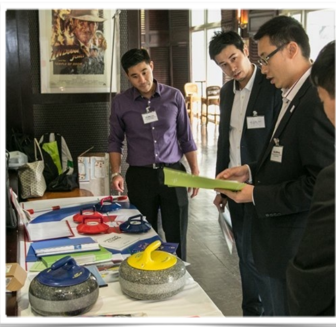
Introducing curling to guests at the inauguration ceremony